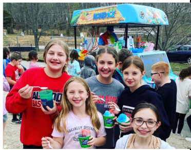
Thanks to all of our guests that helped us celebrate!!!